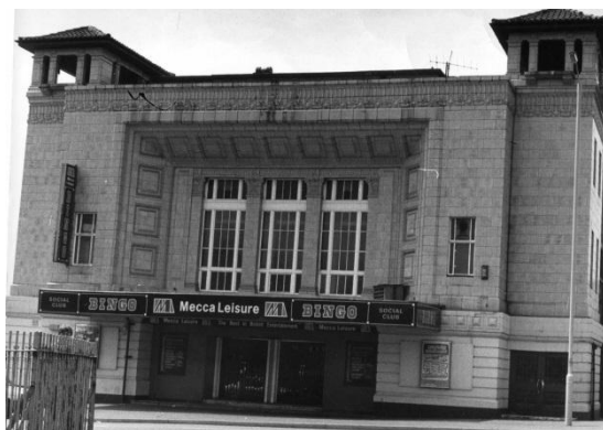
(A bingo hall in Langworthy, Salford in 1984, in a building used previously as a cinema)