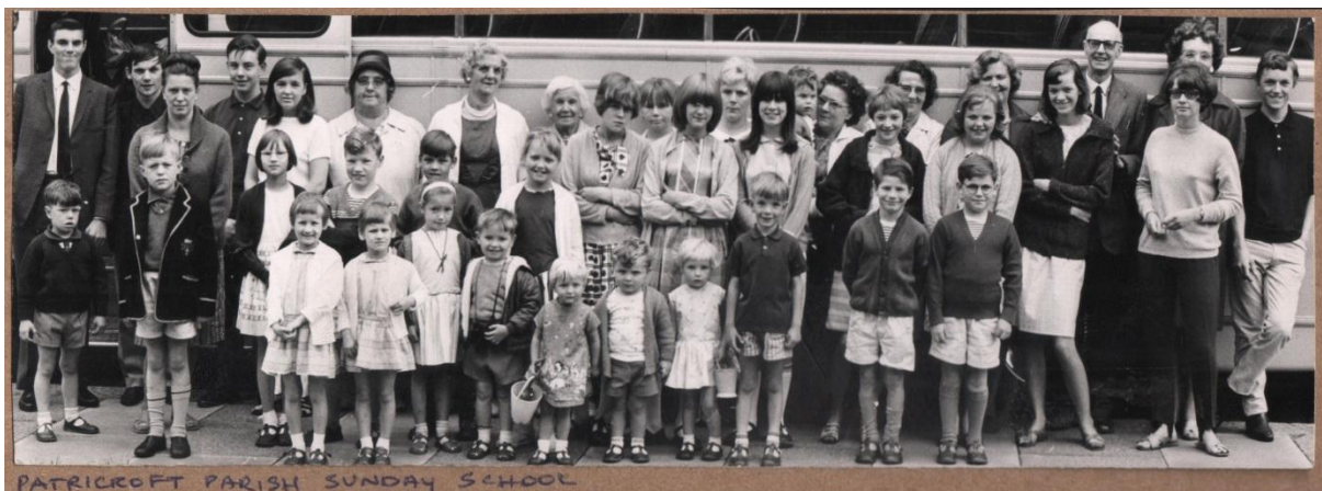
(An excursion to Southport for a Sunday School in Patricroft, Salford in 1966)

c. Why do sources B and C have different views about the use of seaside resorts by British people in the late twentieth century?