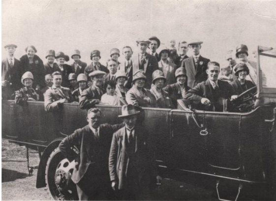
(An excursion to Blackpool for the people of Woodbine Street in Salford in 1926)

a. Use Source A and your own knowledge to describe the main features of day excursions in the 1920s.