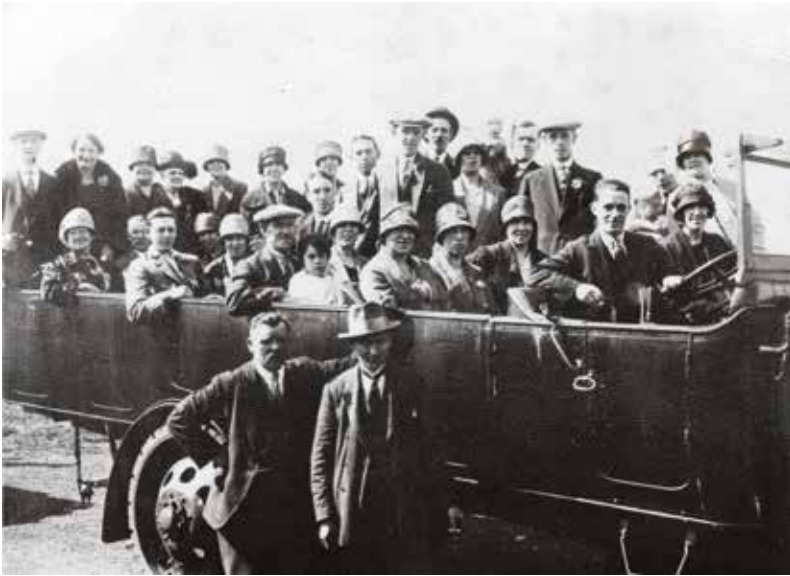
An excursion to Blackpool for the people of Woodbine Street in Salford in 1926