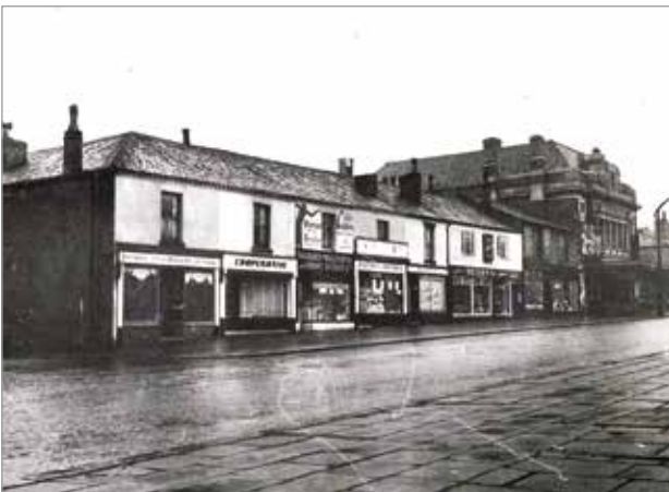
Bolton Road in about 1960