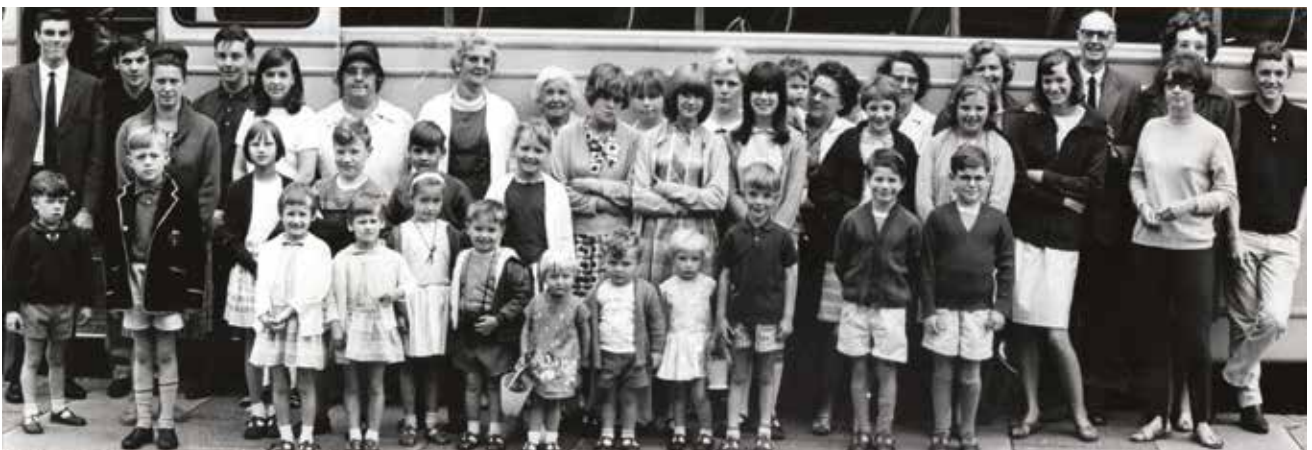
An excursion to Southport for a Sunday School in Patricroft, Salford in 1966