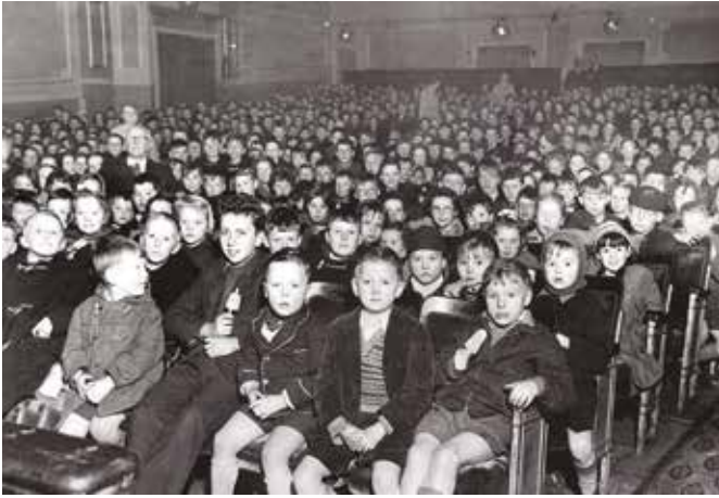
(A Saturday matinee performance at a cinema in Langworthy, Salford in 1957)