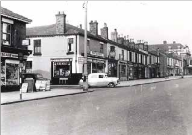
Bolton Road in the 1950s