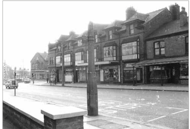
Bolton Road in the 1960s