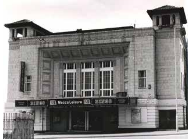
(A bingo hall in Langworthy, Salford in 1984, in a building used previously as a cinema)