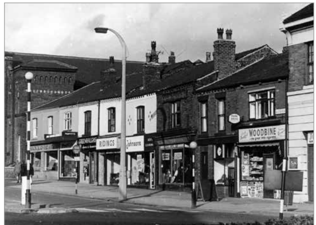
Bolton Road in about 1965